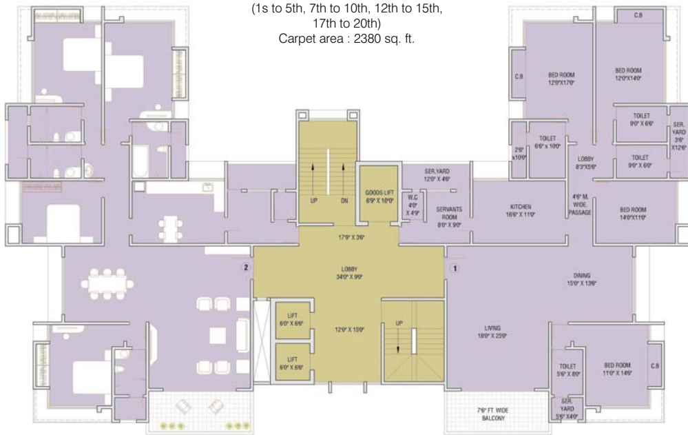
Typical floor plan (1s to 5th, 7th to 10th, 12th to 15th, 17th to 20th) Carpet area : 2380 sq. ft.